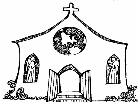
A HOUSE OF PRAYER FOR ALL PEOPLE

Sunday, Aug 10 th $1,363.10 Assumption 237.00 Thank you for your continued prayers and financial support of our parish ministries.