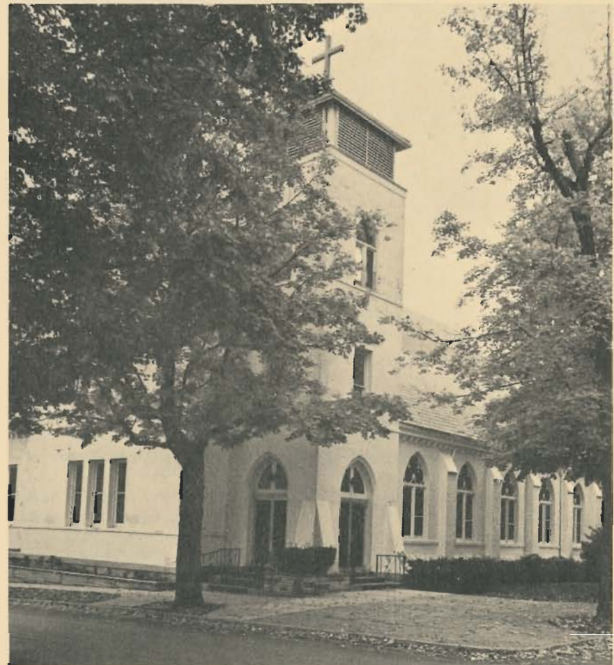
St. Benignus Church