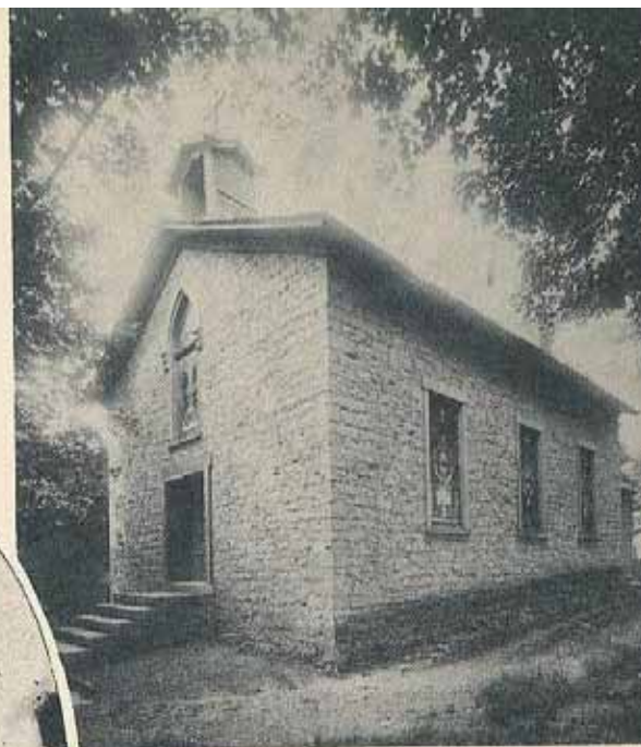
Original St. Benignus Church

Today, as St. Benignus Parish enters the second century of its existence, few of those names are to be found on the church's active rolls. Nevertheless, although the names may be different, the descendants of some of those pioneers, even unto the fifth and sixth generations, retain in their hearts the pride of name, the love for Ireland, and the devotion to God that characterized the founders of the parish.