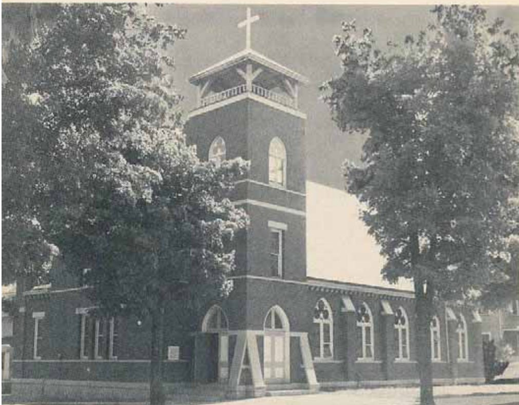
St. Benignus Church