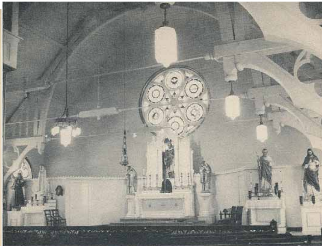
Sanctuary of Present St. Benignus Church